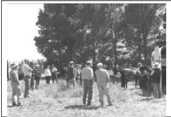
The 'Introduction to Carriage Driving Day' at Wirrimah