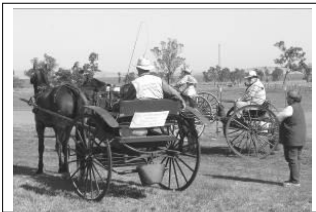
Waiting to start at Windy Station on the Charity Drive

to the organizers from Goulburn club members. Our members are looking forward to next year's drive.