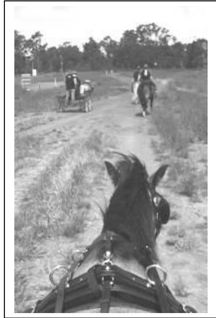
On the Murrumbidgee Club pleasure drive

Robyn Schmetzer: The Murrumbidgee Club held a pleasure drive on October 23 to experience the course we have mapped out for our CDE in September 2017. All agreed it was a lovely drive off busy roads.