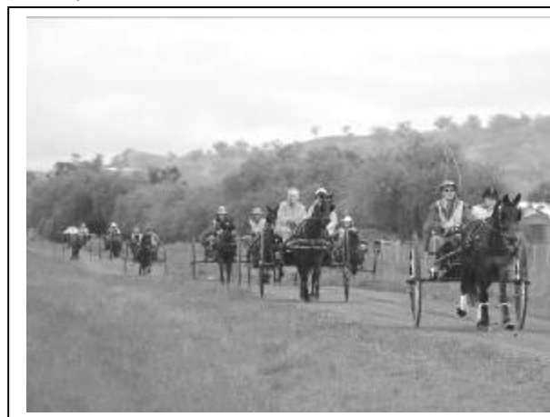
On a quiet lane near Attunga on the Liverpool Range Club Charity Drive

preferred format, and it allows all, including the organizers, to have a pleasant, more relaxing holiday with their horses.