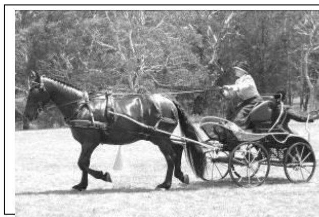
Lyn Cunnew driving Taresh Park Monteya in the Level 4 CDE at Bundanoon (J Knight)