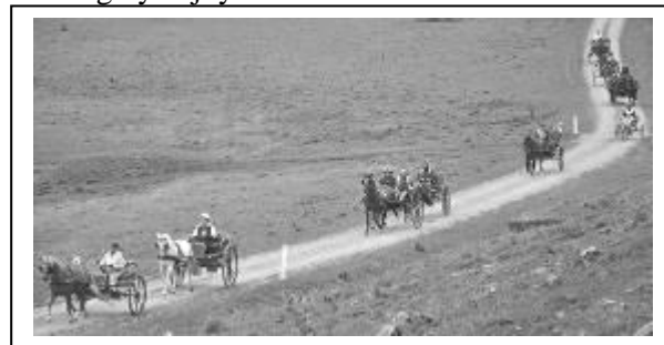
Some of the drivers on the road at Ebor (S Jones)

All drivers and abilities were taken care of, with two drives on both days, one for the larger horses and one for smaller ones or those not quite fit enough at the beginning of the season. Quad bikes both front and back accompanied the drives ensuring safety and looking after the gates. The misty rain and enveloping fog did not hamper the drivers. The first group headed to the ranges on the eastern side of Ebor. After crossing the Guy Fawkes River, the drivers proceeded to 'The Laurels' owned by Brian Hillier. Some 30km was covered, over cattle country, along valleys following water channels, then rising to cross steep hills, sometimes making their own tracks. The views could only be imagined as mist enshrouded them. However, the challenge of the drive was thoroughly enjoyed.