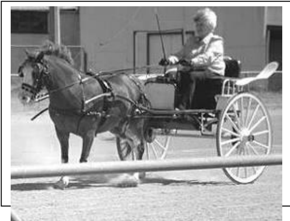
Hercules at Temora