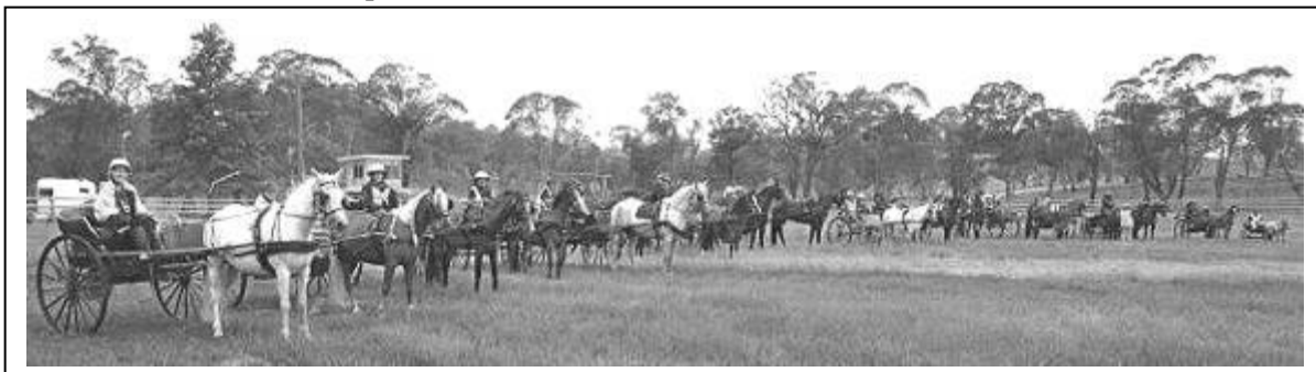
Line up of the drivers at Ebor

Next Meeting: AGM and General Meeting to be held at Manilla on June 28 2014 hosted by the Tamworth Club Accommodation information now available. Book early as accommodation in Manilla is limited.